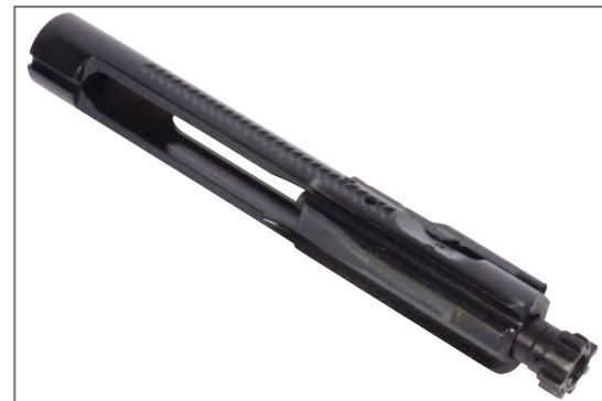
Synthetic Firearm Lubricant provided exceptional performance over rigorous range testing in multiple firearm applications.